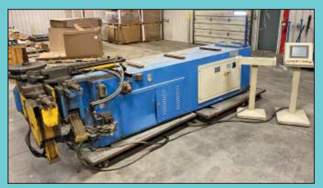
4" Horn Model A100TNCB CNC Hydraulic Tube Bender