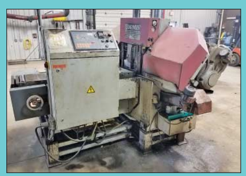
11.8" x 11.8" Behringer Type HBP303A Dual Column Auto Horizontal Band Saw