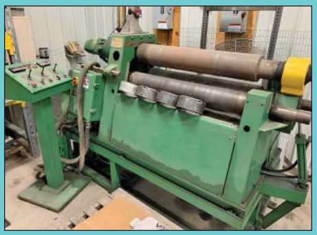
1/4" x 3' Pyramid Style DiPaolo Plate Bending Machine