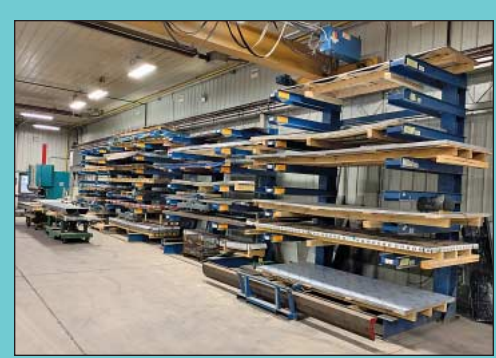
HD Cantilever Racks with Raw Sheet Stock

Trinco Model 36BP Abrasive Blast Cabinet with Dust Collector