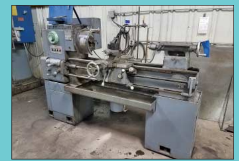
15" x 36" Cincinnnati Hydra-Shift Lathe