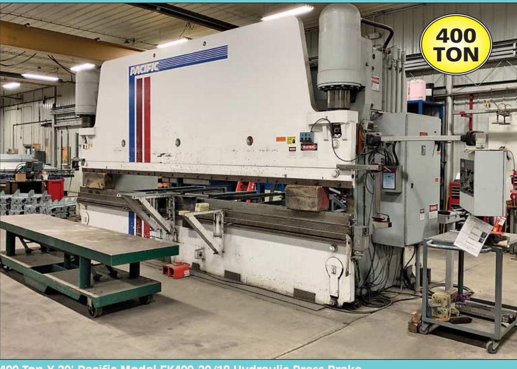
400 Ton X 20' Pacific Model FK400-20/18 Hydraulic Press Brake