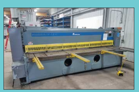
3/8" X 12' Niagara IF-12-3/8 Hydraulic Squaring Shear