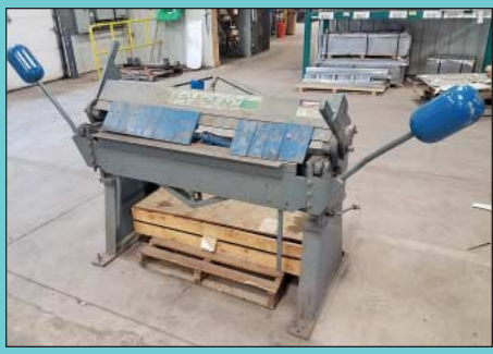
48" Tennsmith Finger Brake