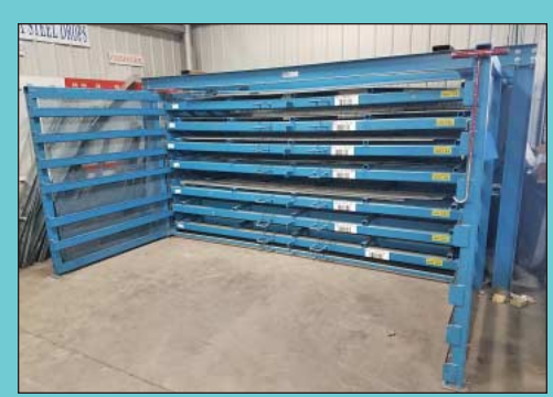
Steel Storage Systems Seven Shelf Steel Storage Rack