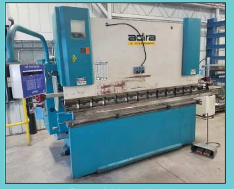
77 Ton X 98" Adira Model QHD-7025 CNC Press Brake