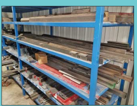
Large Quantity of Various Press Brake Dies