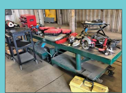
Large Quantity of Electric Hand Tools by Milwaukee