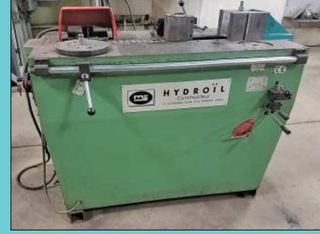
20 Ton Hydroil Type BM-20-350 Model 2000 Horizontal Hydraulic Press