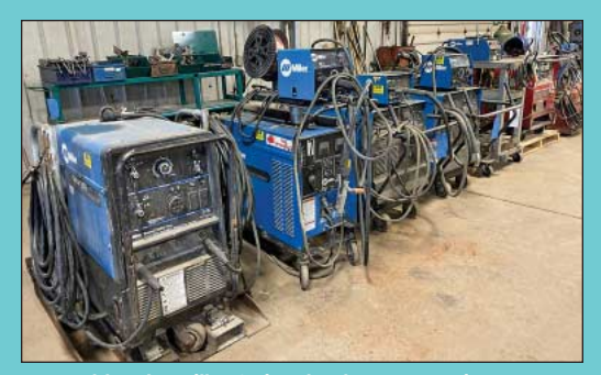
(7+) Welders by Miller & Lincoln Plus Accessories